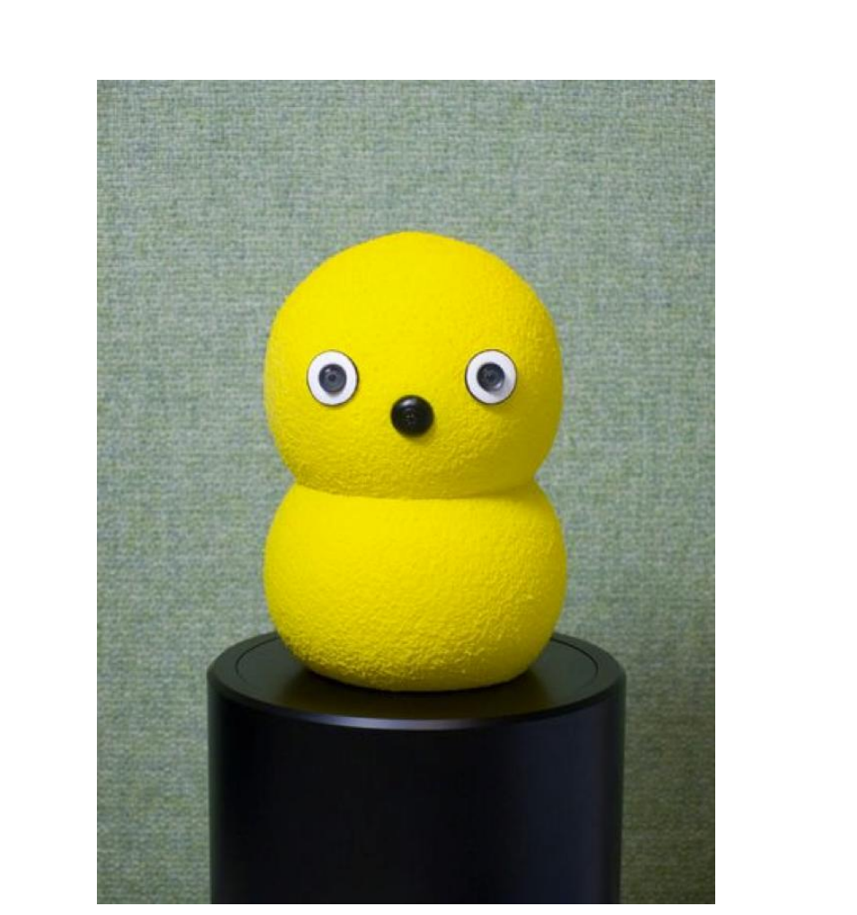
Keepon, the robot participants interacted with in the experiment.

A collaborative robot partner was located on the table next to the participant that could help with the puzzle. Participants could query the robot by asking it questions about the puzzle. An experimenter remotely